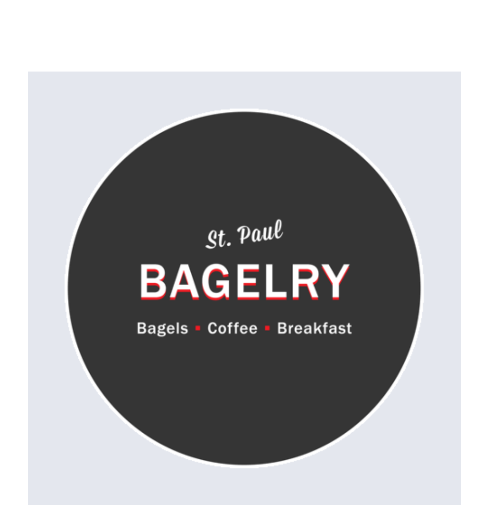
ST. PAUL BAGELRY