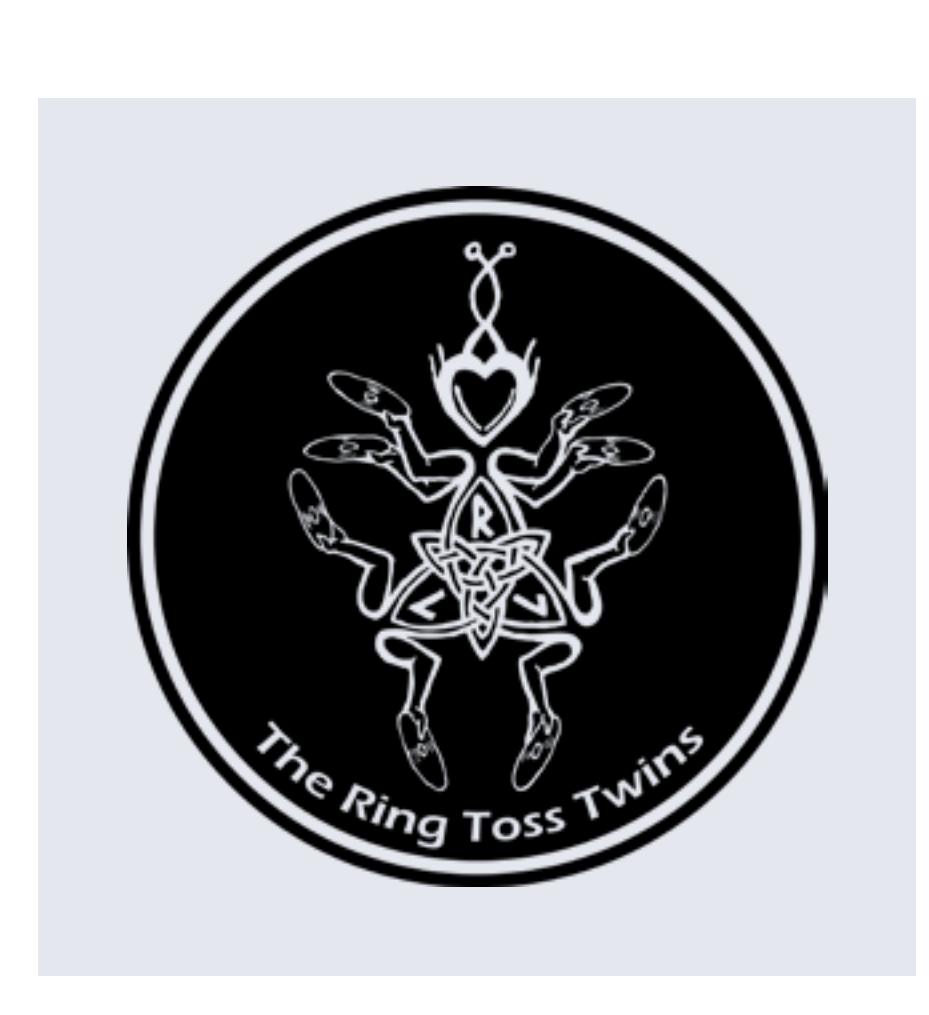
RING TOSS TWINS