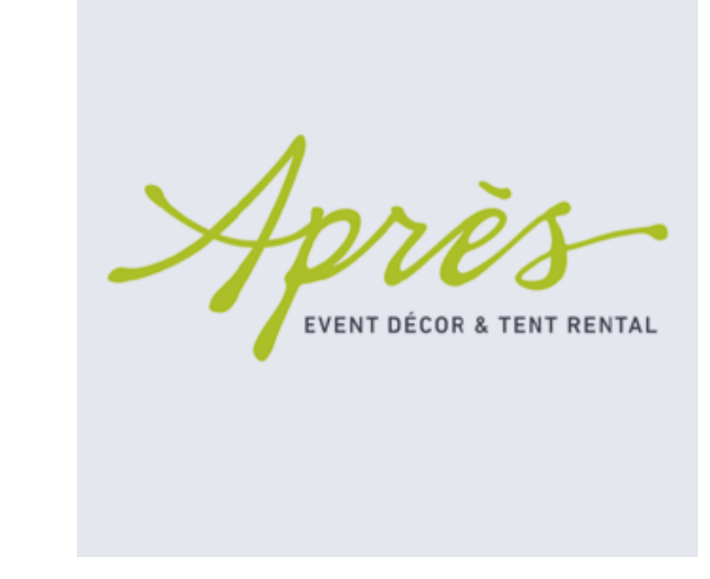
APRÈS EVENT DÉCOR