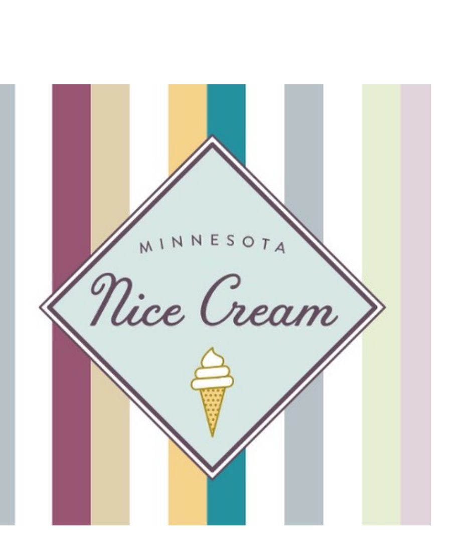
MN NICE CREAM soft-serve ice cream