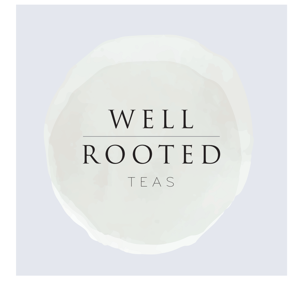
WELL ROOTED TEAS locally foraged herbal iced teas