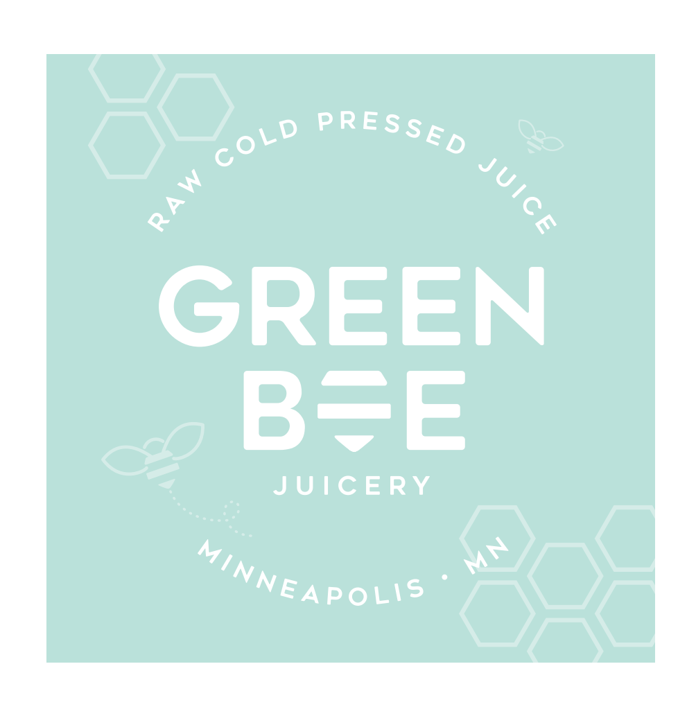
GREEN BEE JUICERY organic cold-pressed juices